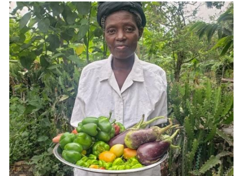
Ending hunger with yard-gardens.

More recently, MFOH has paired cistern construction with support for 100 yard-gardens , and the number is growing as fast as the food! Agronomists train each participant how to prepare the land, plant and grow vegetable seeds and fruit trees, enabling women to feed their families and earn income selling surplus crops.