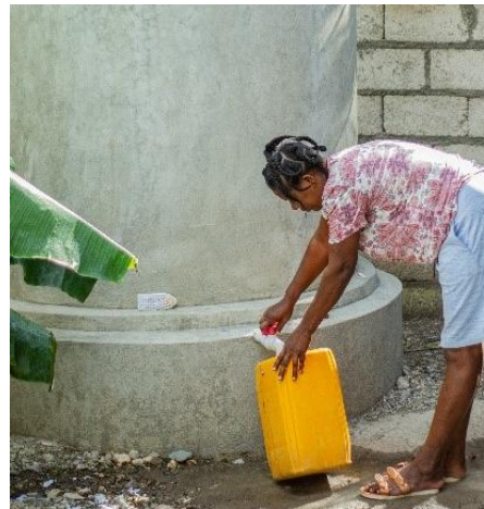
"Dlo se lavi" Water is life!

In 2020, local masons were taught how to construct ferrocement cisterns by hand using locally available materials. In that initial group, 19 masons learned the necessary skills and went to work building 500 to 2,000-gallon cisterns next to homes, schools, parishes, and farms, ensuring community members access to clean and safe water.