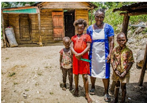
On the pathway to a better life.

Chemen Lavi Miyò (CLM) is an 18-month accompaniment program that helps women experiencing ultra poverty, move from abject hopelessness to a level of self-sufficiency.