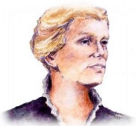
Catherine McAuley Foundress of the Sisters of Mercy

This brief report is intended to highlight the ongoing work in Haiti and some of the new initiatives that will be launched this year. Additional information and points of contact can be found at our website: www.mercyfocusonhaiti.org .