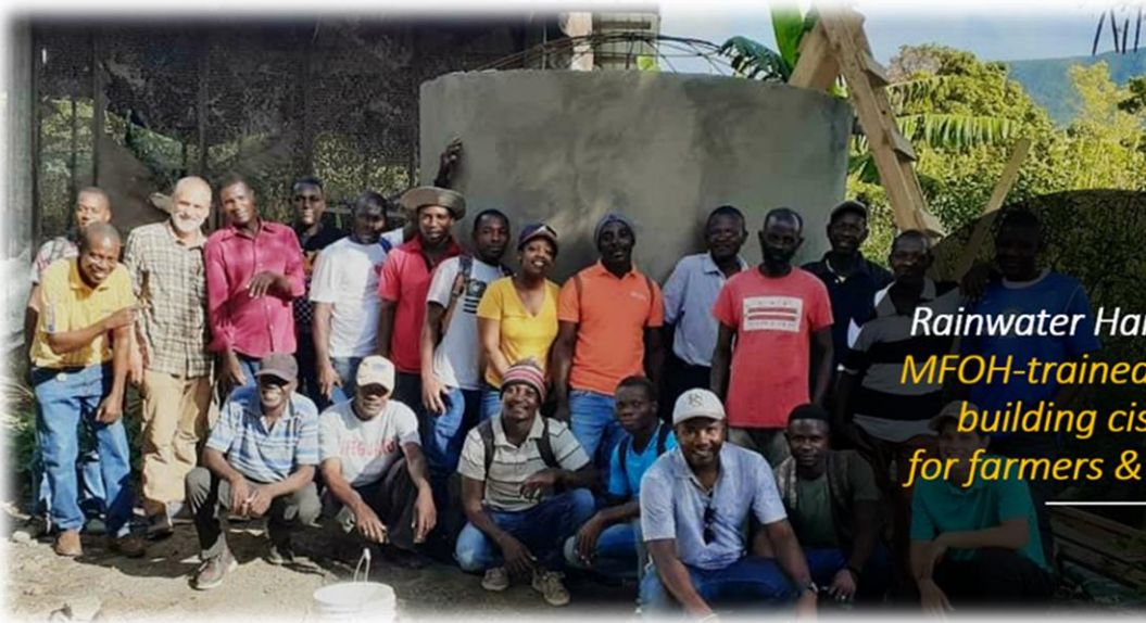
Rainwater Harvesting: MFOH-trained masons building cisterns for farmers & families

MFOH continued to leverage the program's formally trained masons to build additional cisterns throughout the Gros Morne region and to train additional masons through a formal days-long training program. In the last year, over 100 cisterns have been built!