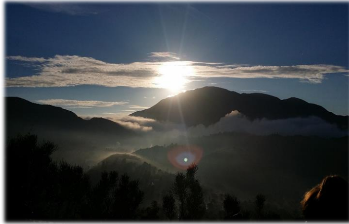
Sunrise Over Gros Morne

With few exceptions, these programs have been in place for most of our first 10 years. They have been honed over time, altered, and augmented, to better respond to the needs of the Haitian participants. We listen to them and follow where they lead us. We have found the Haitians are very resourceful and willing to work with each other and with us. They are resilient, and with our help, they now have the hope of a daily sunrise.